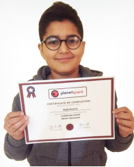
Nakshatra, Age 11

Excellence Course in Communication Skills